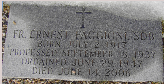
Added by: LadyGoshen